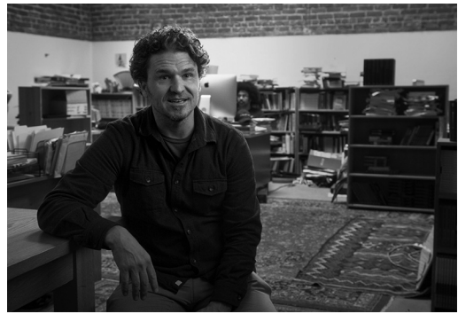
Author and McSweeney's founder Dave Eggers believes books get into our bones in a way that almost nothing else can.