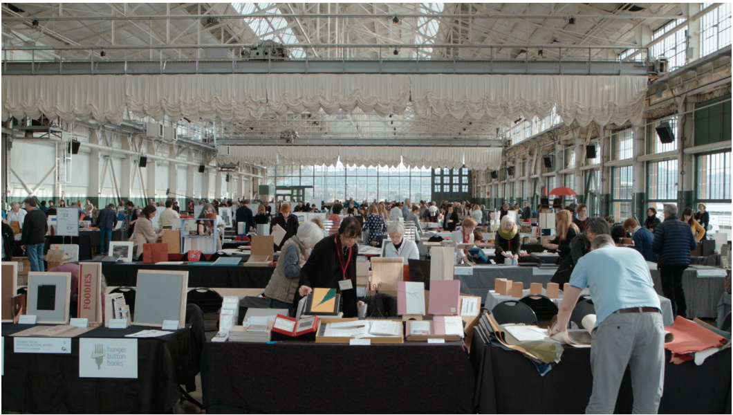
The legendary CODEX Book Fair in the San Francisco Bay Area attracts people from all over the world who make, collect, or just love books.