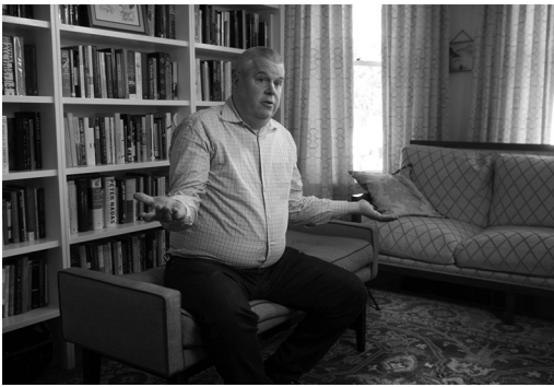
Author Daniel Handler (aka Lemony Snicket) talks about the hypnotic experience of time with a book.