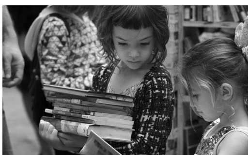
During the annual Bay Area Book Festival in Berkeley, the Lacuna art installation offers free books to the public.