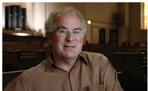
Left: At the Internet Archive, 70 people scan daily as part of a goal to give everyone in the world access to all books. Right: Computer engineer and visionary internet activist Brewster Kahle founded the Internet Archive, a foundation that continues to digitise all the world’s books created in human history.