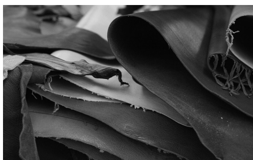
Coloured goat skins for book covers. At the CODEX Book Fair, suppliers, authors, collectors, librarians, and bibliophiles gather in the name of books.

SWS: As an observer, what are your thoughts on the future of the book arts?